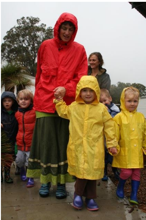
Kindergarten Bush Walks in the Rain